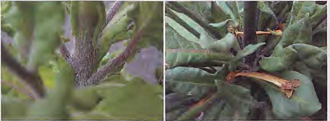
Figure 3. Leaf bases and lower stem indumentum; N. maritima . Note dense indumentum, sub-auriculate leaf bases and winged petioles. Cultivated, RBGV Melbourne nursery.